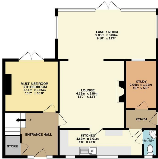
GROUND FLOOR 69.7 sq.m. (751 sq.ft.) approx.